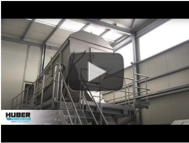
Video: HUBER Grit Treatment Systems

https://www.youtube.com/watch?v=nNstEvZA-24