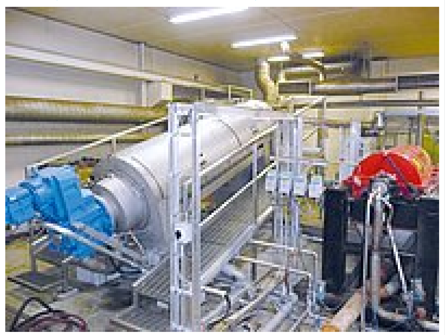
Screw Press RoS 3Q 620 beside the maintenance-prone decanter

Cost-efficient, low wear: HUBER ROTAMAT® Screw Press RoS 3Q in Finland