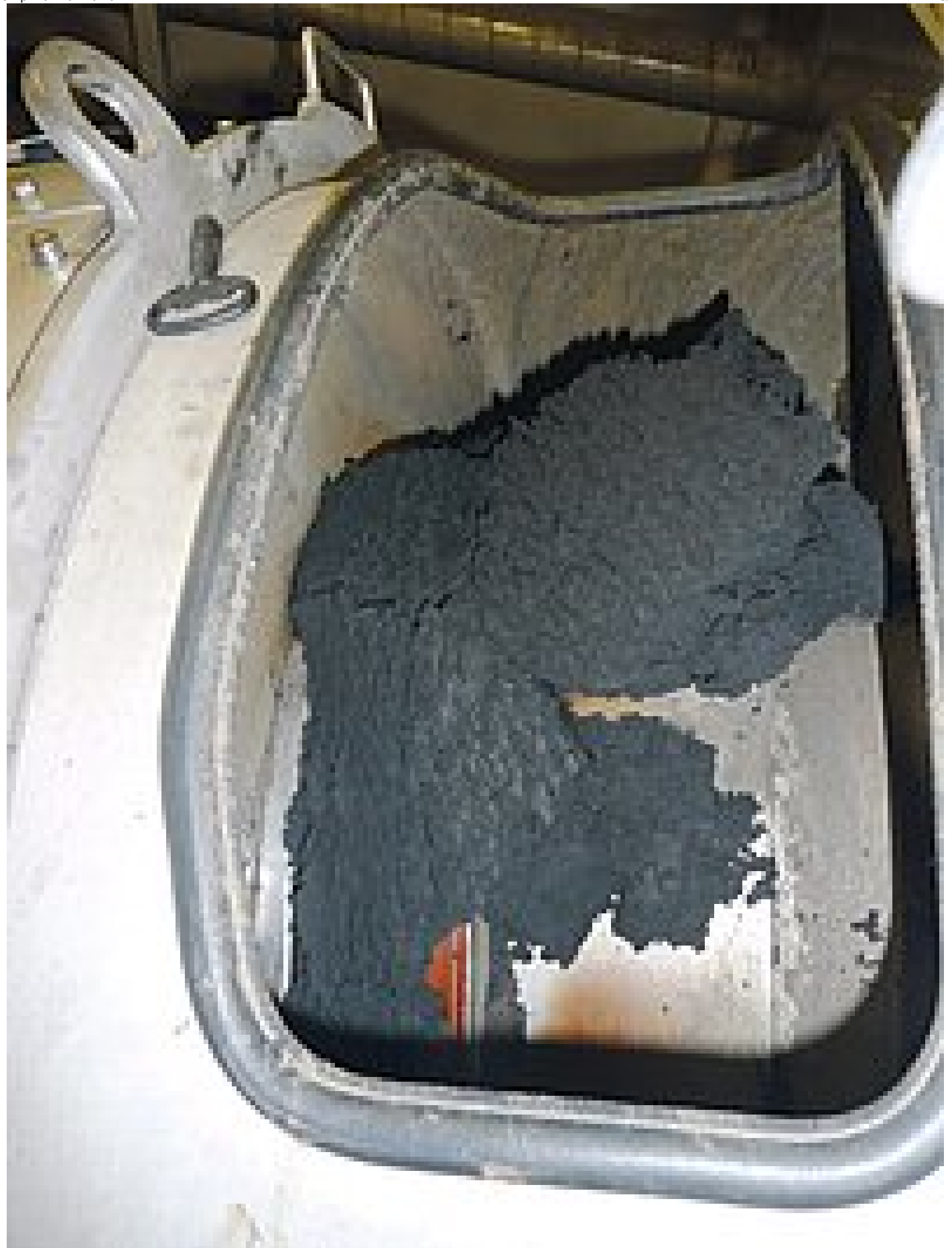
Dewatered sewage sludge from the RoS 3Q 620 screw press

It remains to be seen in how far maintenance costs will decrease in Hämeenlinna which were the decisive factor for the customer to buy the HUBER product. On the basis of the experience we have made over many years with our ROTAMAT® Screw Press RoS 3Q units, however, we expect savings of 70 to 80% compared to the centrifuges.