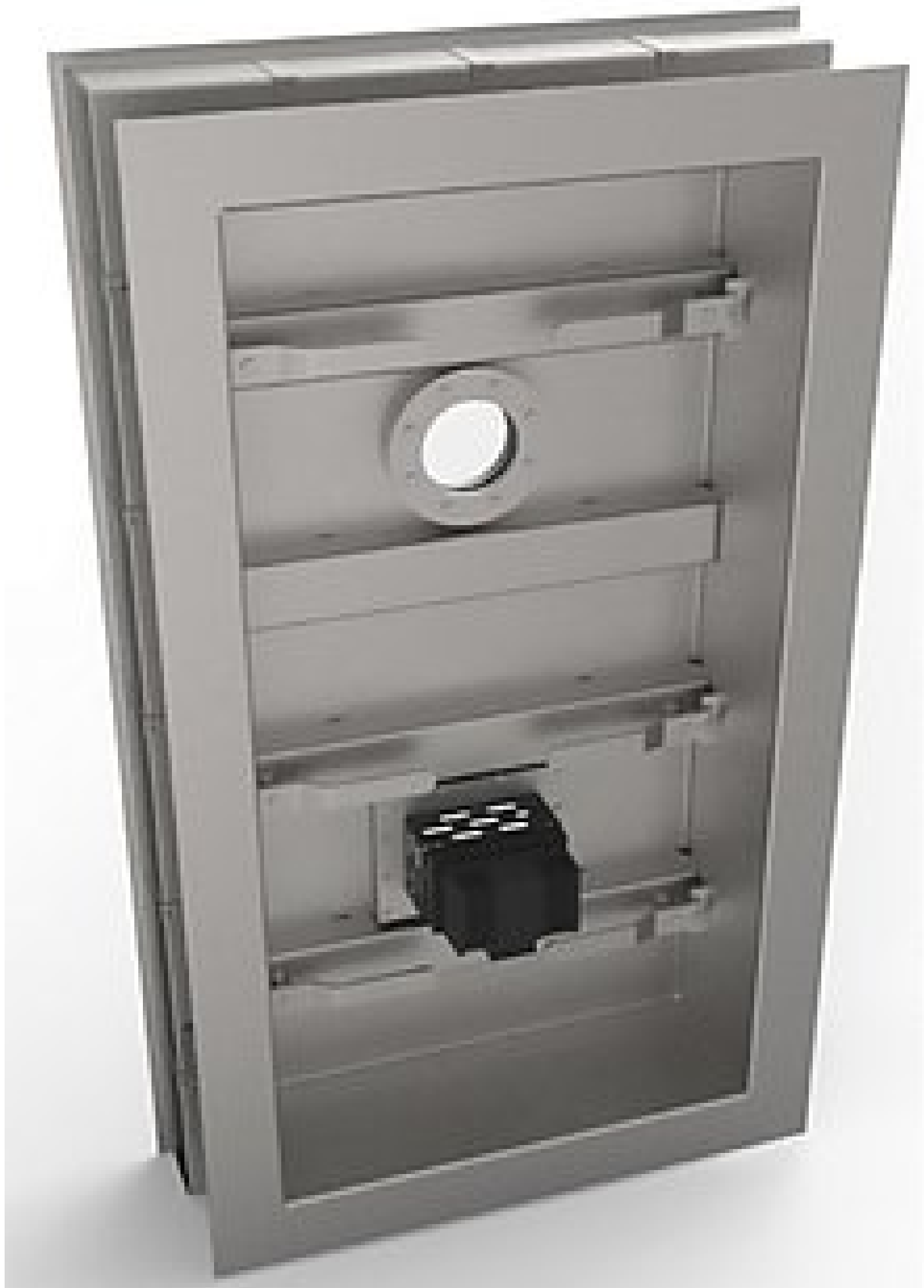
HUBER pressure door TT7 with inspection window and spotlight