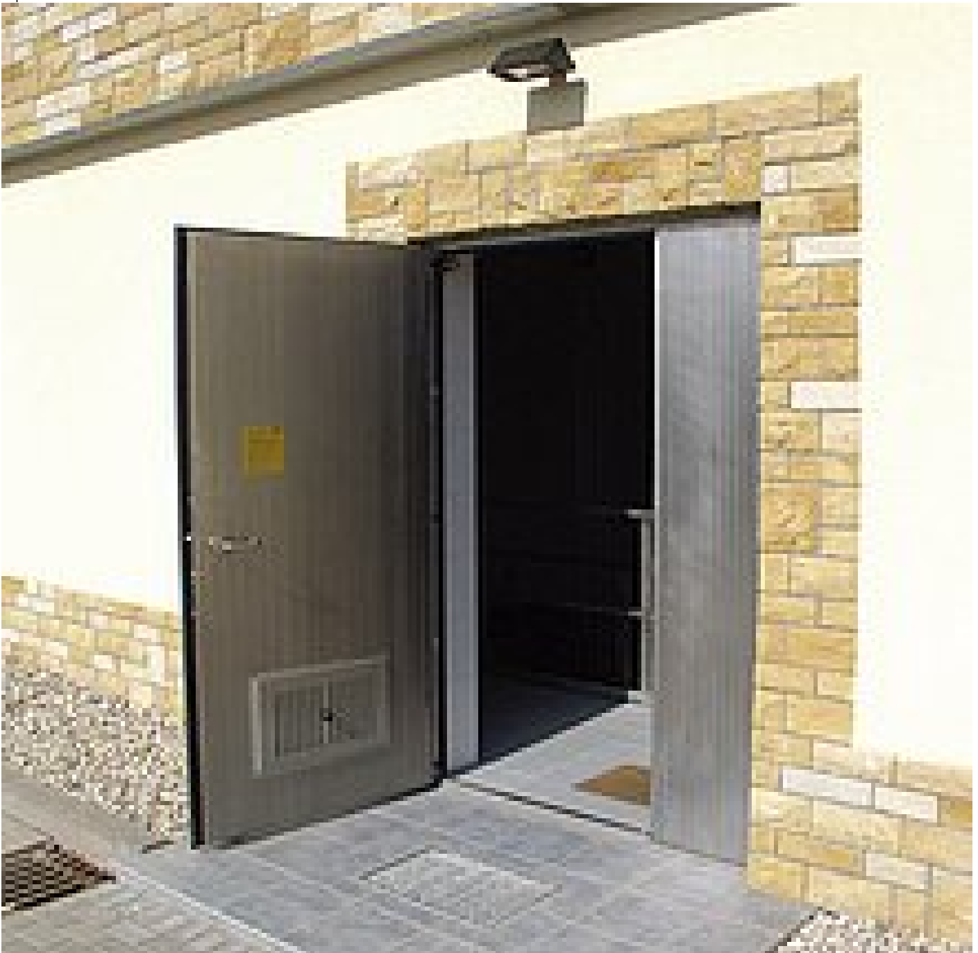
Attack-proof security door TT2, certified to resistance class RC3

The resistance value in time is the time an expert needs to break a mechanical barrier with the use of appropriate tools. In connection with burglar alarm systems, the resistance value in time is the time between alarm release and burglary. This time should be longer than the time the action force needs to reach the place of attack for intervention. Besides, the offender will probably stop the burglar attempt if the barrier is too resistant.