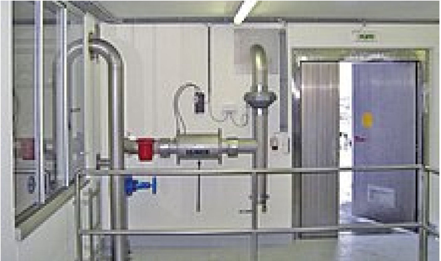
Installation example of "active forced ventilation" in the elevated reservoir Utzenaich, Austria

Drinking water supply structures are in most cases erected by construction companies as principal contractor. When construction companies receive the order for building a drinking water reservoir, they need a partner who can supply both high-quality products and the expertise required to provide economical solutions with maximum customer satisfaction.