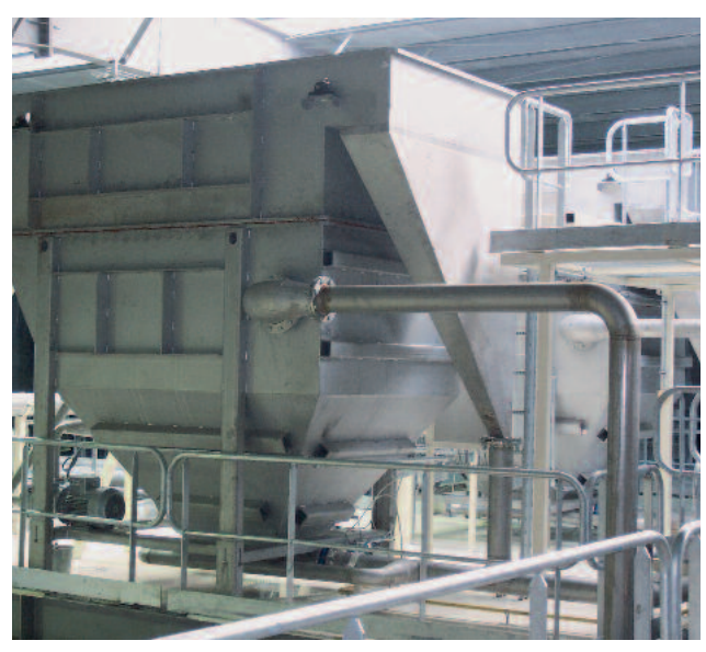
Paper factory Kronostar, Russia Dissolved Air Flotation Plant HDF-7 throughput: 70 m³/h