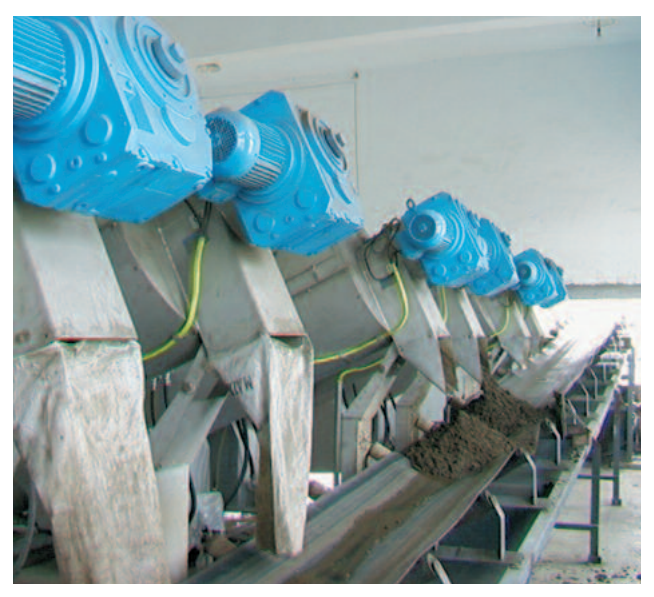
Paper factory Lingaong, China: dewatering of primary / biological sludge to > 28 % DS with HUBER ROTAMAT® Sludge Dewatering Plant RoS 3