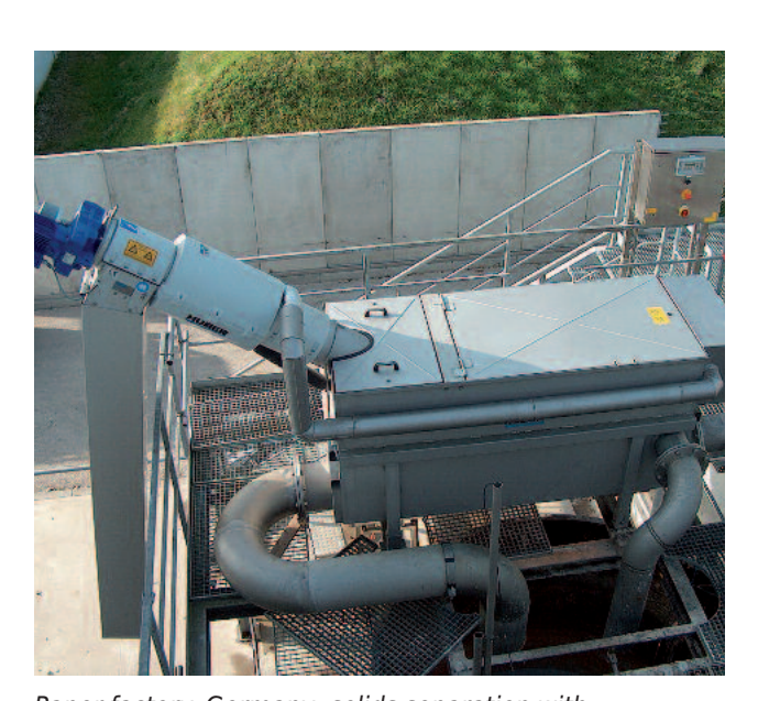
Paper factory, Germany: solids separation with HUBER ROTAMAT ^{\rm 8} Ro 2