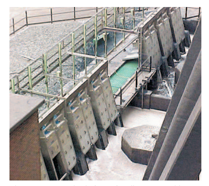
River water extraction in front of cooling towers with HUBER STEP SCREEN® SSV, Sasol South Africa