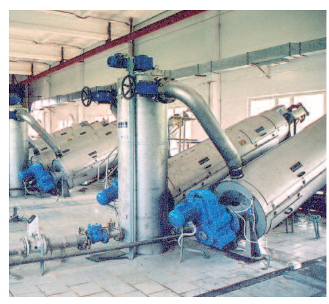
Kievskiy PPM II, Ukraine) HUBER ROTAMAT® Screw Press RoS 3