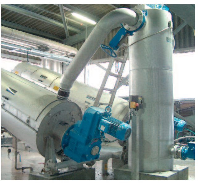
Paper factory SCA Oftringen (CH) HUBER ROTAMAT® Screw Press RoS 3