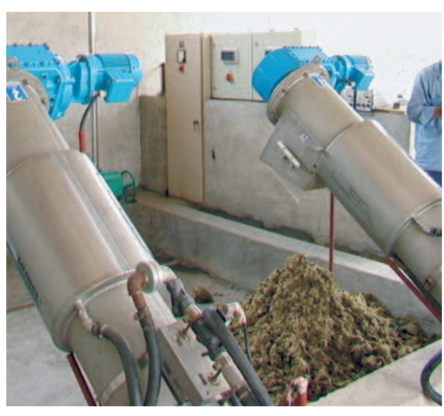
Paper factory Lingaong, China: mechanical preliminary treatment with HUBER ROTAMAT® Rotary Drum Fine Screen Ro 2, 1 mm, solids retention > 60 %