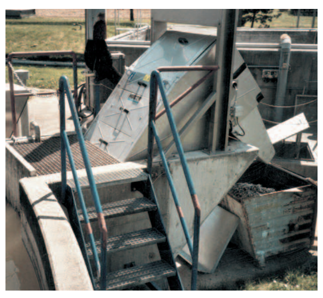
MD Paper Factory, Germany: solids / suspended material separation with HUBER STEP SCREEN® SSF