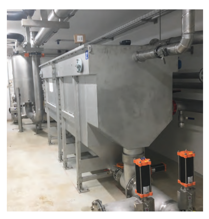
HUBER Heat Exchanger RoWin for heat recovery and wastewater cooling – energy optimisation and compliance with temperature limits.