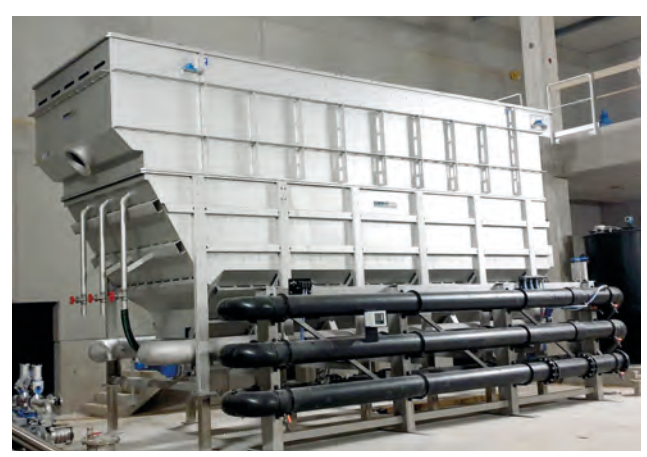
HUBER Dissolved Air Flotation for physical-chemical pretreatment – optimum reduction of COD, fats and solids, more than 500 installations worldwide.