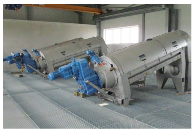
HUBER Screw Press units for sludge treatment – best dewaterin costs.