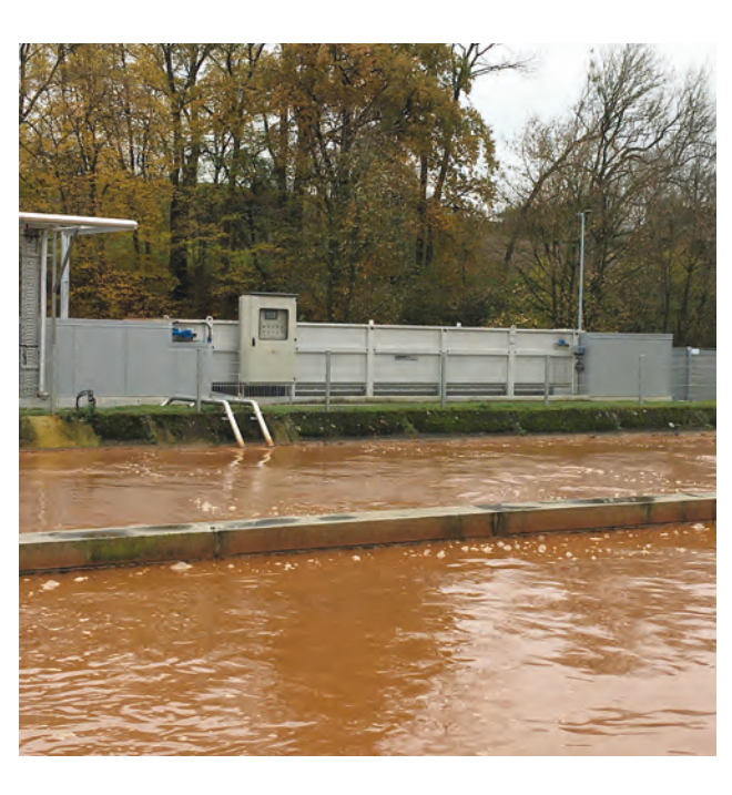
HUBER Dissolved Air Flotation systems for sludge separation and effluent treatment – the solution for upgrading overloaded wastewater treatment plants.