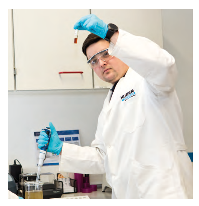
Preliminary tests in the laboratory or on site to determine operating parameters and effluent values – safety for customers and operators.