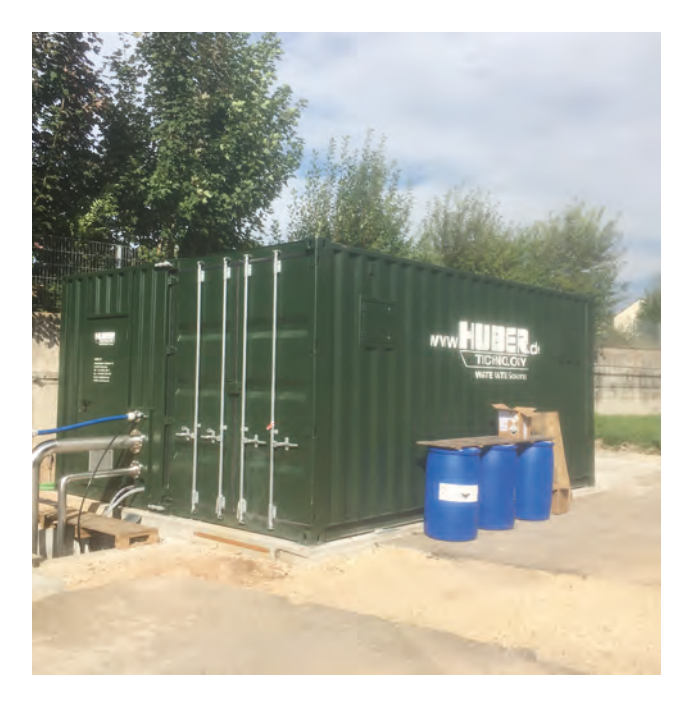
HUBER plant technology in container design – flotation or sludge dewatering units without construction work – ready for immediate use.