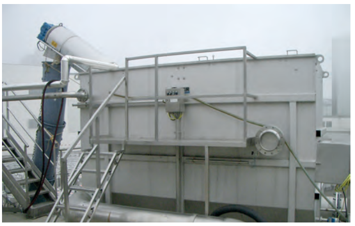
HUBER screening systems for mechanical pre-treatment – efficient, durable and well proven.