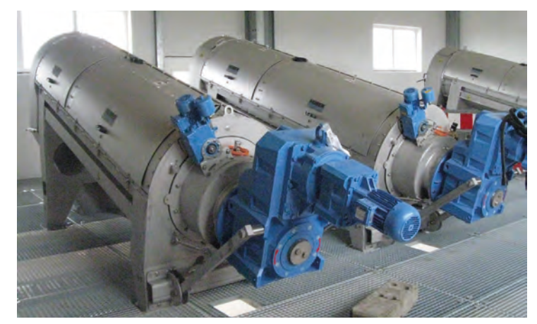
g performance and highest volume reduction for lower disposal