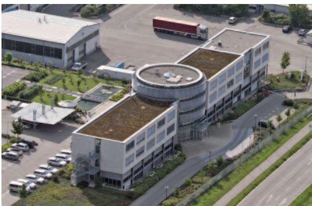
Office building of HUBER SE in Berching