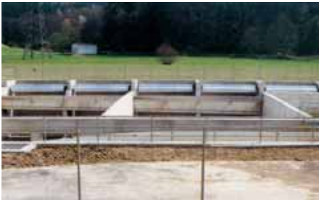
Stormwater holding sewer with integrated chamber for installation of tipping buckets

During the tipping action the flush water is diverted by a concrete radius at the tank bottom from the vertical into horizontal direction. The medium used can be potable water, used water or wastewater, the necessary amount depending on tipping height, base slope and flushing lane length to be cleaned. The tipping buckets can be suspended on the side wall, ceiling or front wall.