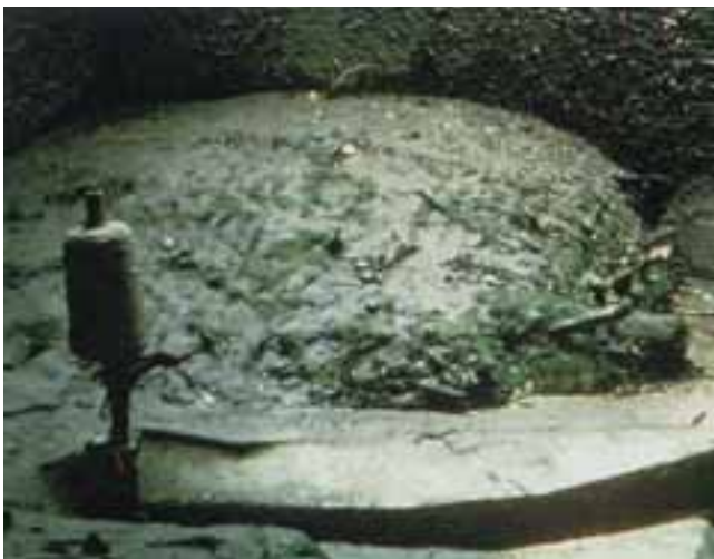
Sediments in tanks without automatic cleaning

For safety and health reasons manual cleaning has to be carried out by a team with adequate self-containing breathing apparatus, especially in covered tanks, due to the special ambient conditions. There are however low-cost alternative mechanical systems available to perform such expensive manual work.