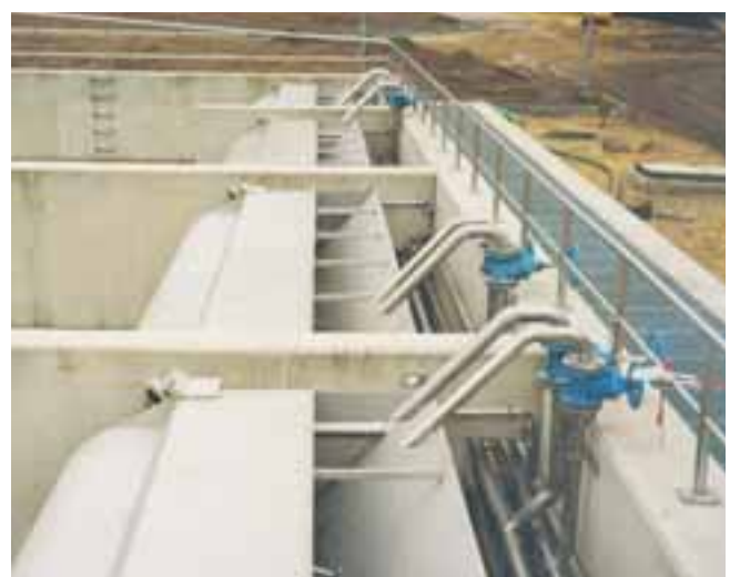
Tipping buckets with flushing medium supply

Systems which generate a flush are suitable to clean storage tanks with a rectangular basal surface. An especially reliable and cost-effective solution to remove the settled material are tipping buckets as they neither have moveable parts submerged in wastewater nor do they require any special flushing medium. Tipping buckets are arranged on the tank side opposite to the