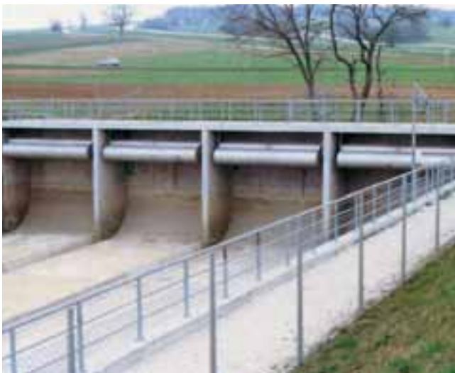
Tipping buckets suspended on side walls in a rectangular storage tank