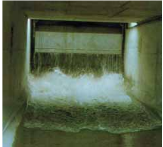
Tipping action in a covered structure