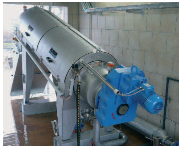
RoS 3Q dewatering unit