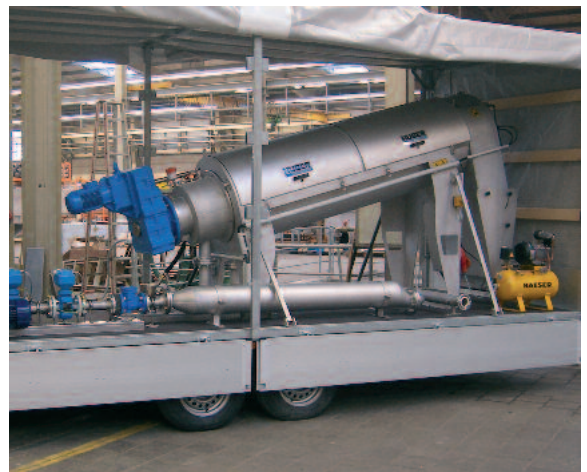
A complete RoS 3Q Plant mounted on a trailer