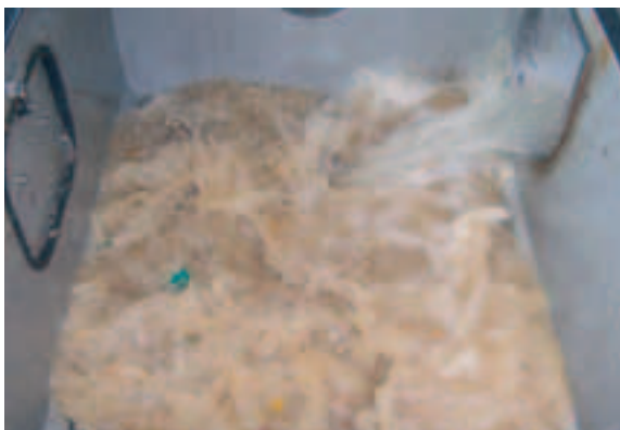
High turbulence in the launder tank during impeller operation

The screenings drop from the screen or conveyor into the launder tank. Screened wastewater or process water is directly introduced into the tank as wash water.