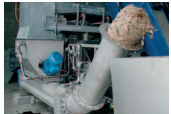
Well washed and virtually odorless screenings from a WAP/SL, compacted to 50 % DS