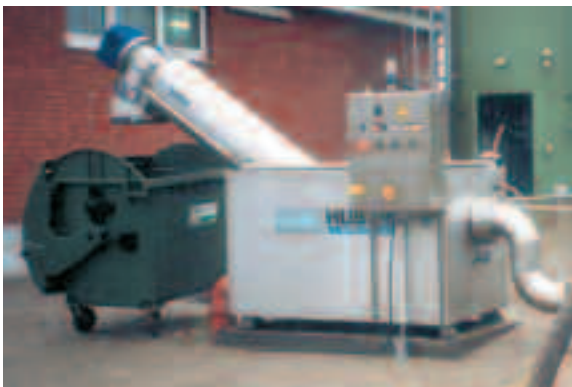
ROTAMAT® Sludge Acceptance Plant Ro 3.1 with ROTAMAT® Fine Screen, heated and insulated unit

It is fully self-cleansing as its rake tines fully engage the basket bars. (Please find more detailed information in our separate Ro 1 brochure.)