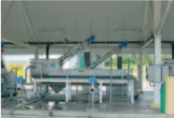
ROTAMAT® Sludge Acceptance Plant with un aerated grit trap and integrated grit classifying screw

Due to integration of all components in a single tank it is a very compact plant and odour annoyance is prevented. Complete treatment of the septic sludge is performed within a single unit.