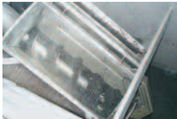
Floating and suspended material is retained in the screen basket. The tines mesh into the basket bars and ensure a complete automatic cleaning.