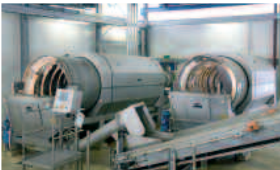
ROTAMAT® Sludge Acceptance Plant RoFAS