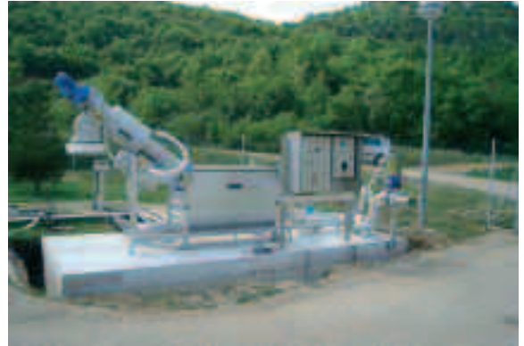
Well-proven mechanical pre-treatment components combined within the ROTAMAT® Sludge Acceptance Plant Ro 3.3

Due to integration of all components in a single tank it is a very compact plant and odour annoyance is prevented. Complete treatment of the septic sludge is performed within a single unit.