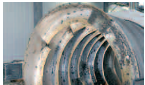
50 l screenings per rotation