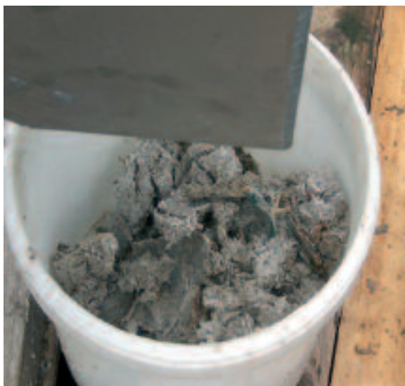
Screening of municipal wastewater with a high content of fibres (in particular toilet paper)