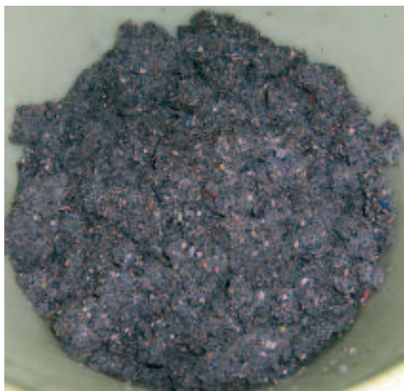
The Pipestrainer removes very fine screenings (such as hairs) after a preceding coarse screen