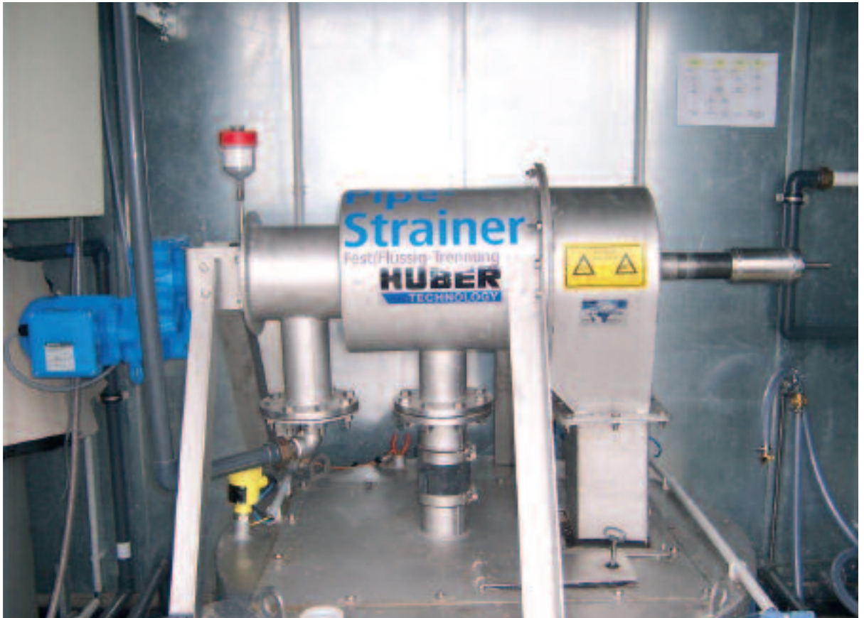
Pipestrainer used for brown water screening for later humus recovery