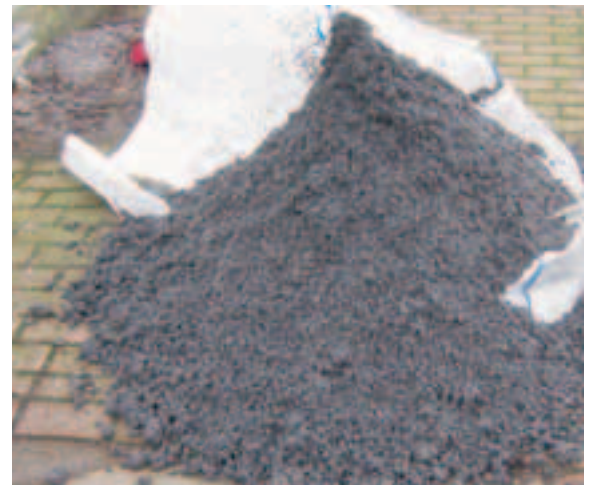
Screenings discharged from a HUBER Wash Press WAP