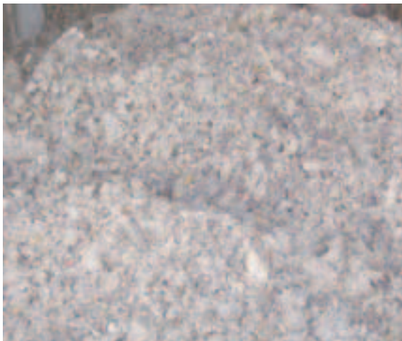
Complete separation of fibers